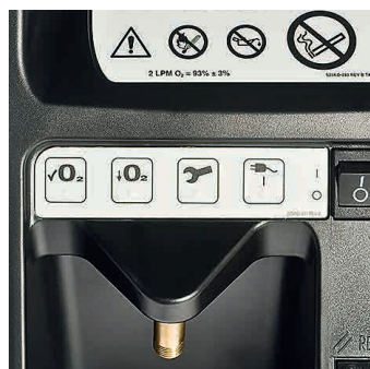
Front label with easy to read pictograms